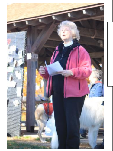
Ellendale gave the blessing of the animals.