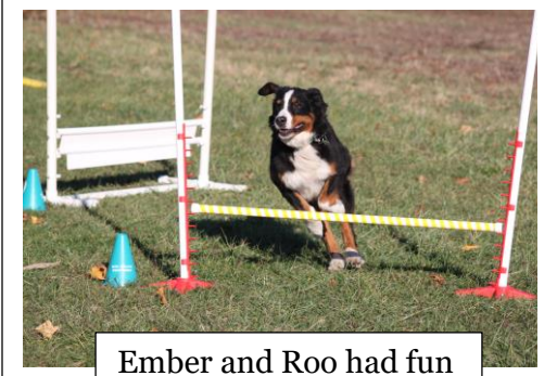
Ember and Roo had fun on D Tails' agility course!